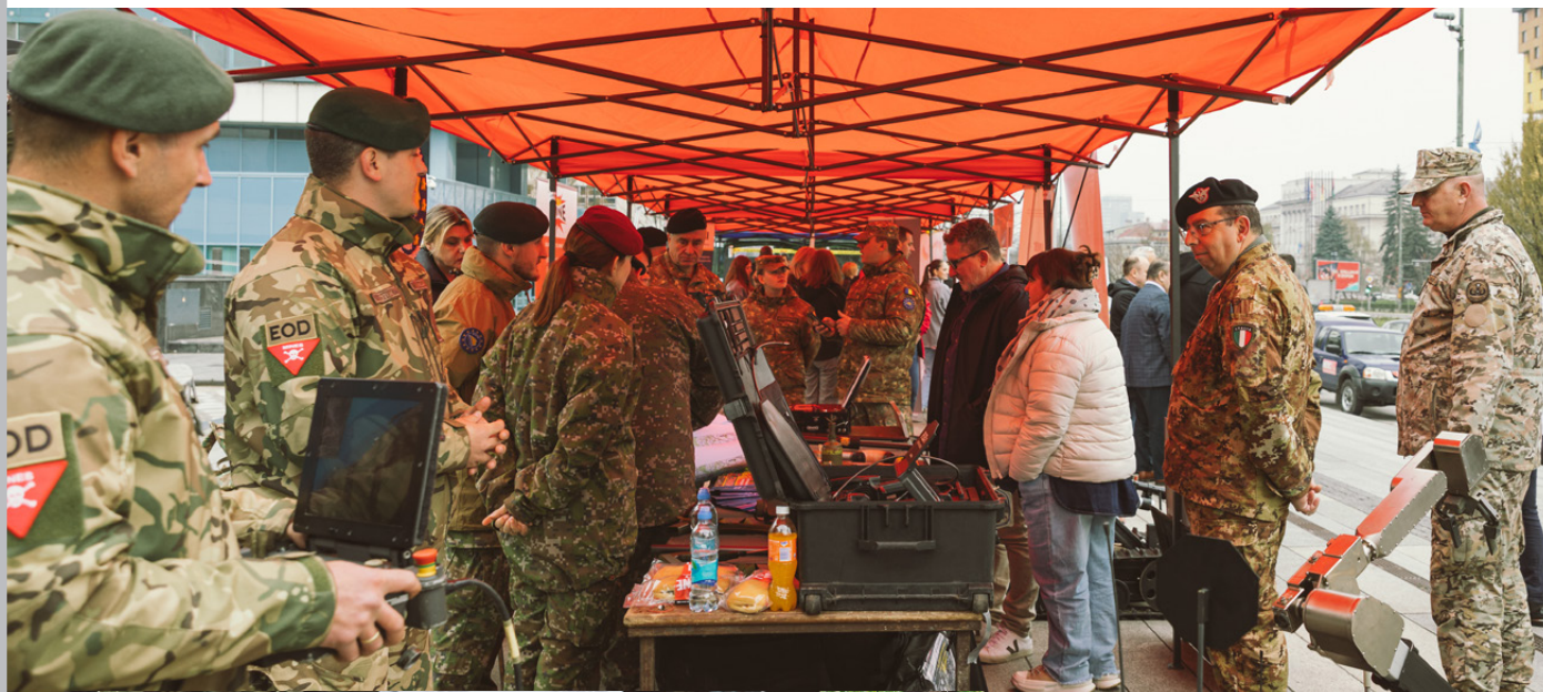
EUFOR personnel showcasing EUFOR capabilities and equipment to the local population