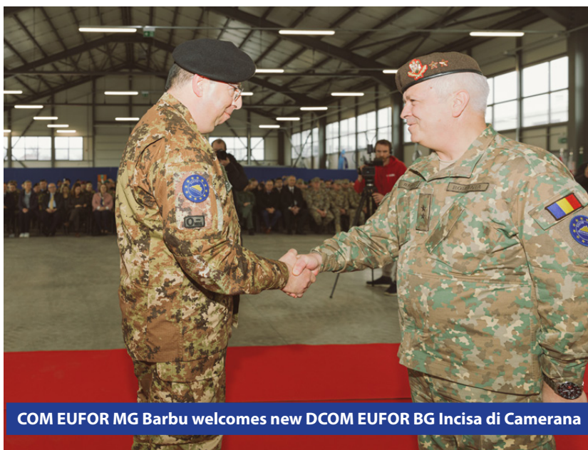
COM EUFOR MG Barbu welcomes new DCOM EUFOR BG Incisa di Camerana

The establishment of the Deputy Commander position reinforces EUFOR's commitment to enhancing its operational capabilities in support of Bosnia and Herzegovina. EUFOR remains a steadfast, capable, and reliable partner in maintaining a safe and secure environment for all the people of BiH.