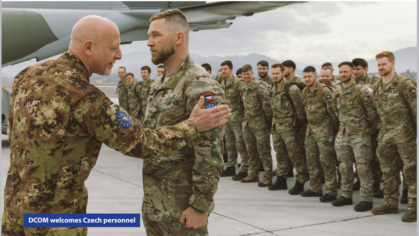
DCOM welcomes Czech personnel

During March 2025, EUFOR welcomed the arrival of Reserve Forces to Op Althea by land and by air. The Reserve Forces were comprised of multiple nations demonstrating EUFOR's capability to quickly reinforce Op Althea with military personnel, vehicles, equipment and enhanced capability.