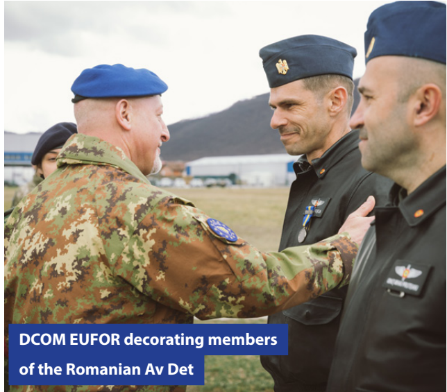
DCOM EUFOR decorating members of the Romanian Av Det

An international medal parade was held in Camp Butmir on 14 March 2025 where members of 13 nations: Austria, Belgium, Chile, France, Germany, Greece, Hungary, Italy, North-Macedonia, Romania, Slovakia, Spain and Türkiye received their well-deserved European Union Common Security and Defence Policy Medal for Operation Althea.