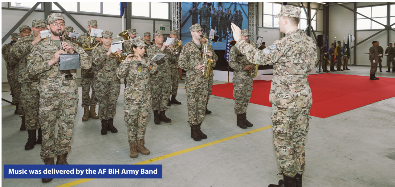
Music was delivered by the AF BiH Army Band