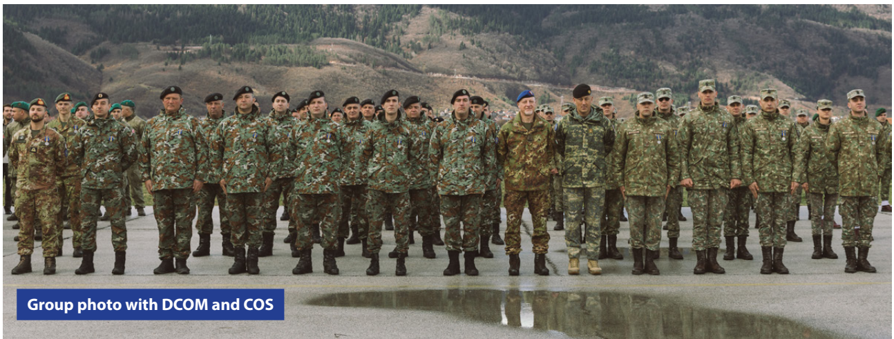
Group photo with DCOM and COS