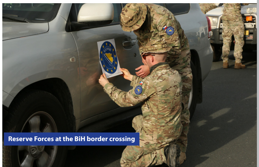
Reserve Forces at the BiH border crossing

of EUFOR personnel is a strong and visible sign of EUFOR's unity and unwavering commitment to stability and security in BiH. EUFOR's capacity as a multinational force is essential in supporting BiH institutions in maintaining a safe and secure environment for all citizens of BiH.