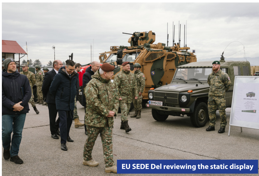
EU SEDE Del reviewing the static display

COM EUFOR expressed his thanks to the EU SEDE delegation for their visit and highlighted his appreciation for the EU's continued support. EUFOR looks forward to working together with all partners to uphold peace and stability in BiH.