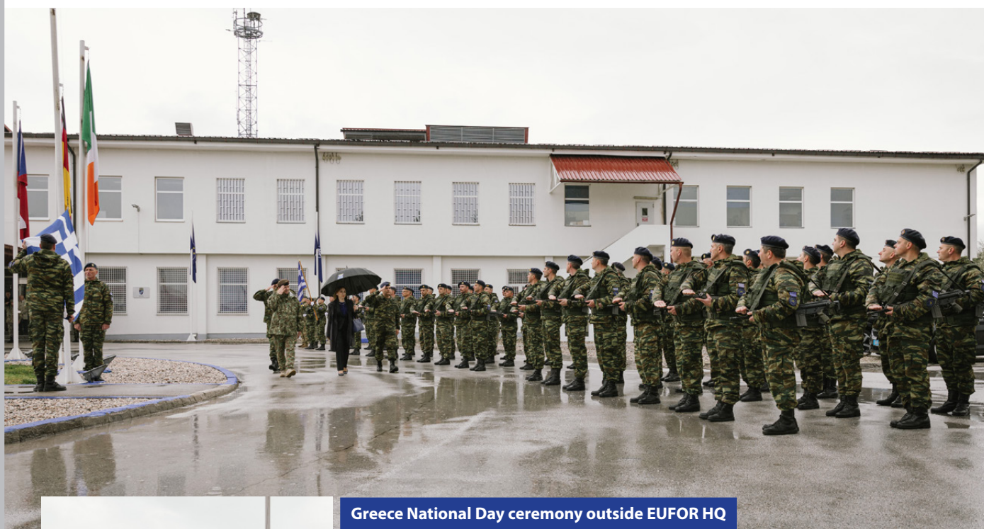
Greece National Day ceremony outside EUFOR HQ