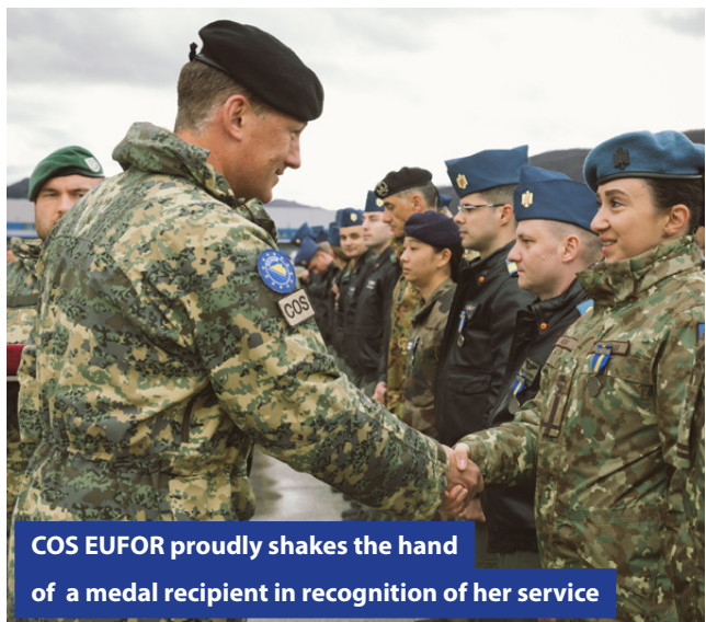
COS EUFOR proudly shakes the hand of a medal recipient in recognition of her service

Congratulations to all medal recipients.