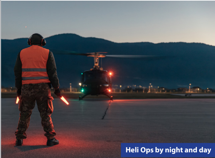
Heli Ops by night and day