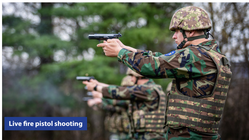
Live fire pistol shooting