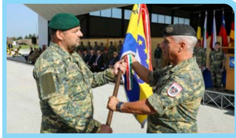
MNBN Transfer of Authority

The FOC exercise took place in Hotel Igman outside Sarajevo. During this exercise the contingent accompanied by a Platoon from the Romanian Armed Forces demonstrated their operational capabilities, with a number of dynamic serials testing everything from first aid and CASEVAC to company level tactical deployments. The exercises was conducted by COM MNBN who then certified the contingents as having achieved FOC to COM EUFOR and clearing them for deployment.