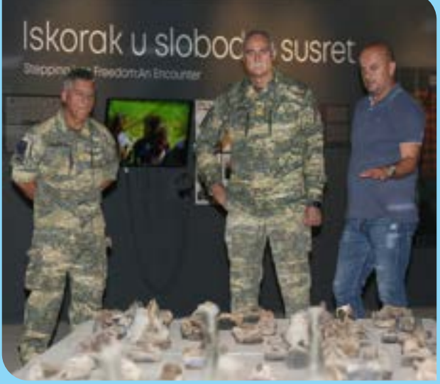
COM EUFOR visited the Srebrenica Memorial Center, where he had a meeting with the deputy director of the center. The delegation then partook in an informative guided tour through the center.