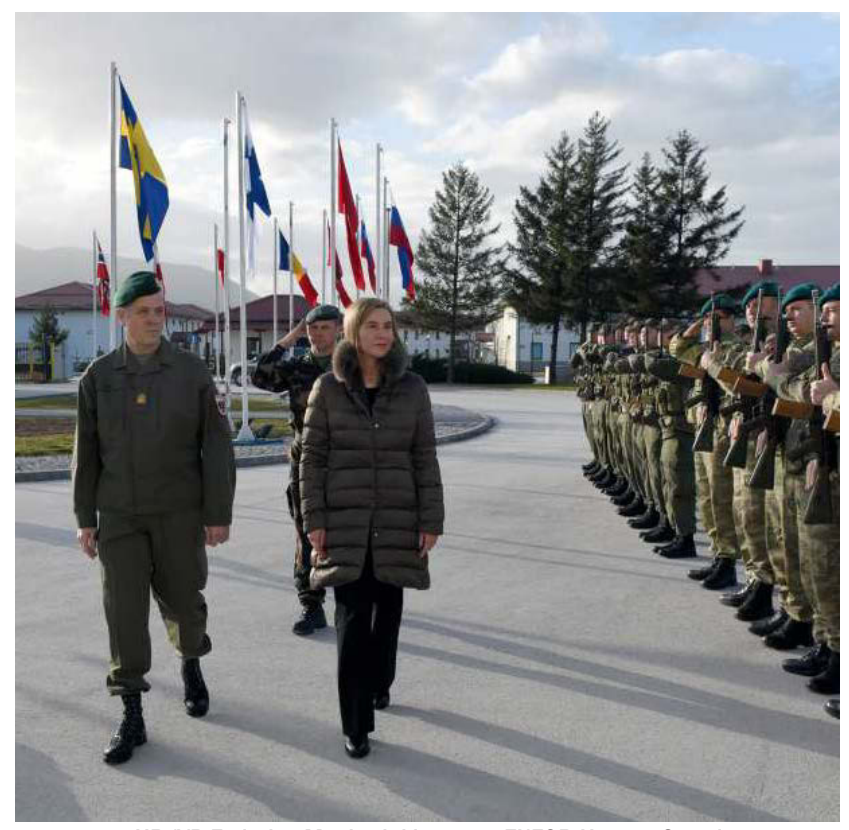
HR/VP Federica Mogherini inspects EUFOR Honour Guard

From 16 - 19 February 2015 The Turkish Platoon of the EUFOR Multinational Battalion (MNBN) conducted peacekeeping training with the Bosnian Armed Forces at Prijedor in the northwest of