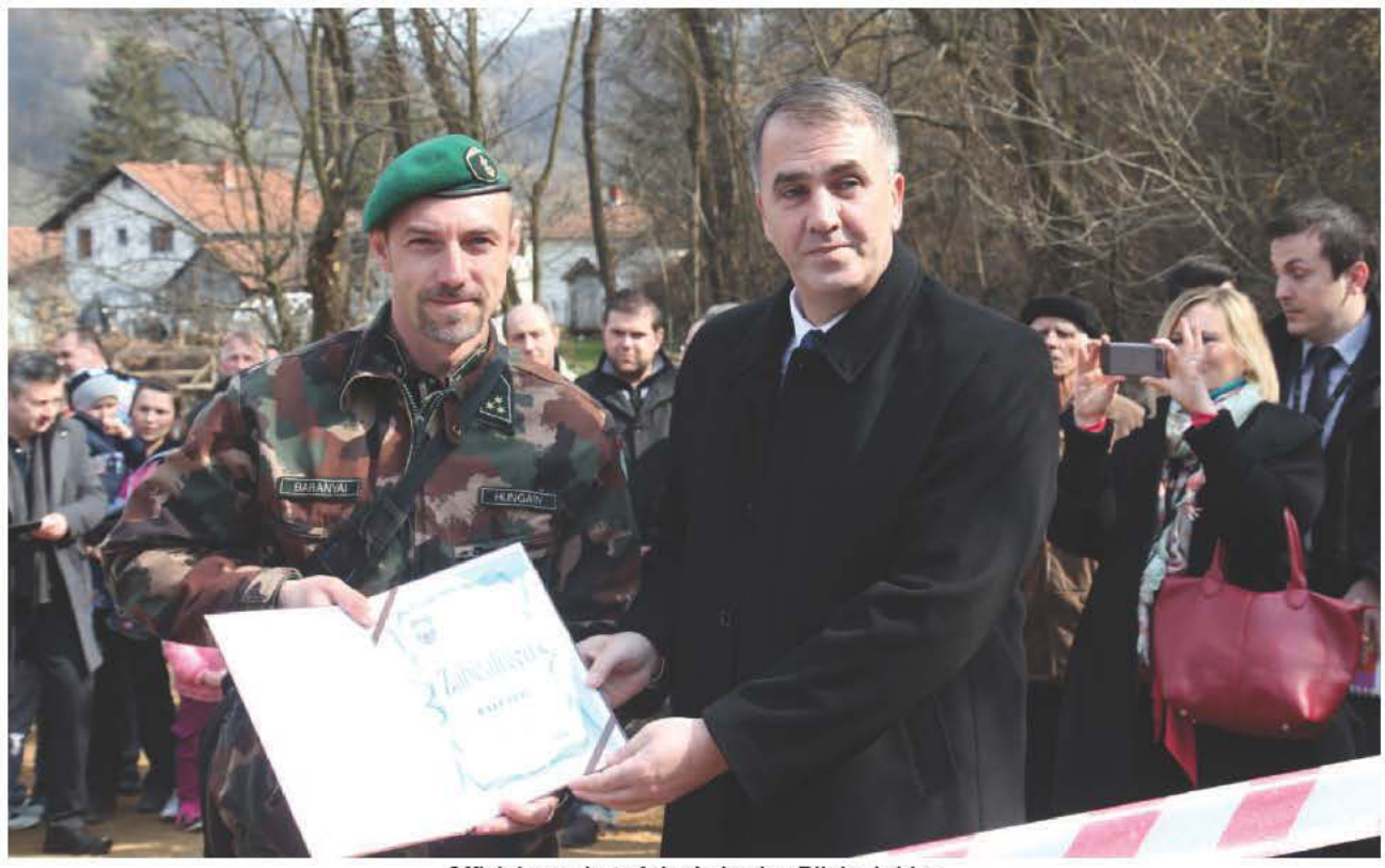
Official opening of the Lukavica Rijeka bridge

On 10 March 2015, the mayor of Lukavica Rijeka invited representatives of the Armed Forces of BiH, EUFOR and UNDP for the official opening ceremony of a bridge in this village near Doboj.