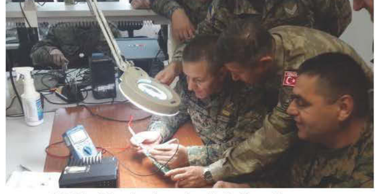
AF BiH soldiers beeing trained in Radio maintenance

Turkey donated 300 radio communication devices in 2011, which are used in both military and humanitarian emergency situations. This training course was designed to allow the AFBiH students to keep the radio communication devices functioning