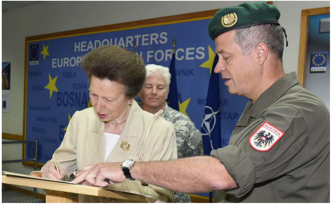
Her Royal Highness Princess Royal signs EUFOR guest book at the entrance of Building 200

On 10 July, Her Royal Highness The Princess Royal visited EUFOR personnel based in Camp Butmir, Sarajevo.