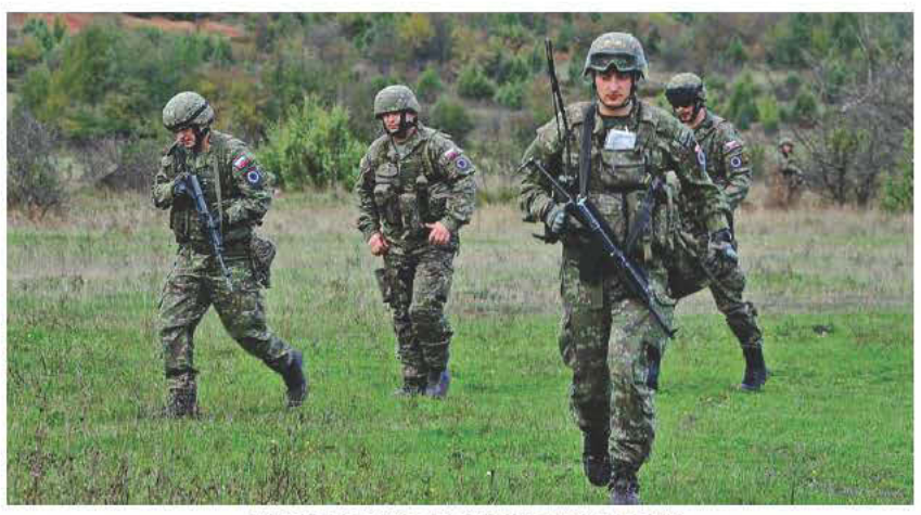
Members of the Slovakian IR Company

The event featured a Live Demonstration, during which the visitors witnessed a display of Peace Support Operations. The scenario for the display included EUFOR