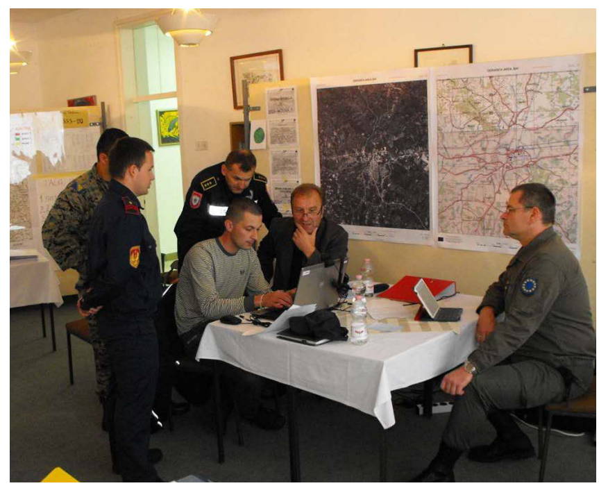
Disaster relief trainig discussions

On 14 May 2015 the Turkish contingent via its Liason Observation Team (LOT) in Travnik donated new equipment to the maternity department of Travnik hospital.