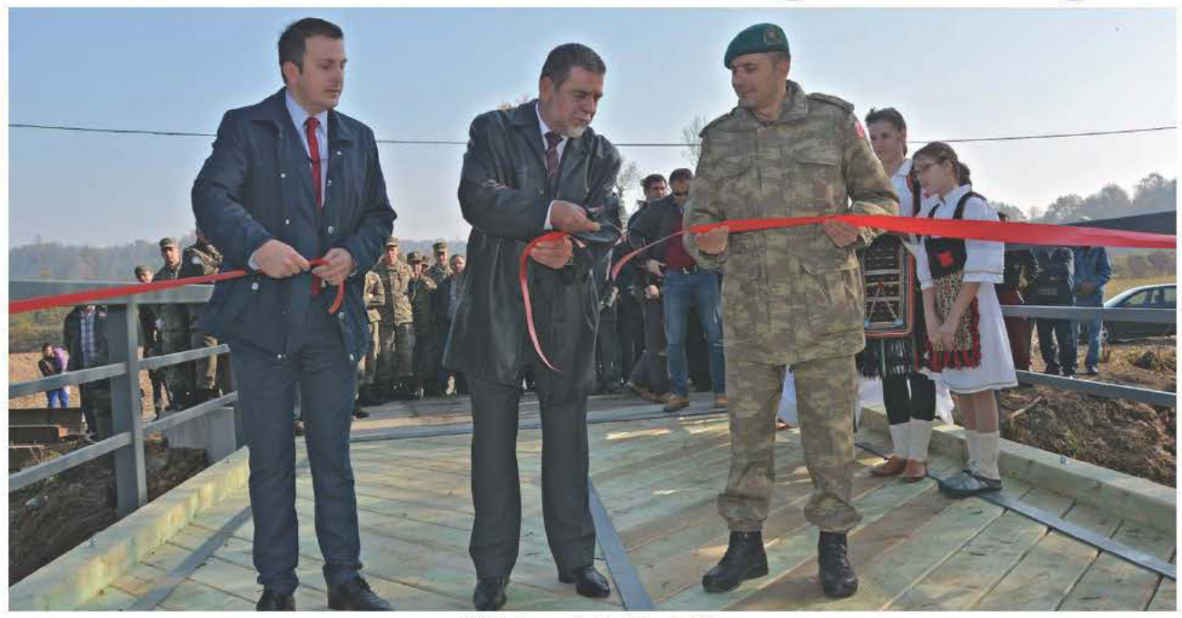
Official opening of the bridge

On November. municipality of Derventa officially took ownership of a bridge built by a EUFOR and Armed Forces of Bosnia and Herzegovina (AFBiH) team. The transfer of ownership was marked with a ribbon cutting ceremony attended by EUFOR officers and local dignitaries. The bridge, built over the river Ukrina near Donje Detlak, was built as part of a programme run by the EUFOR Capacity Building & Training department, during which engineers from the AFBiH were mentored as they constructed the new bridge. The project to build the bridge was started in July 2015, when a reconnaissance was conducted on the site. Civilian contractors were employed to install the concrete supporting pillars, and on the 19th of October the construction of the bridge itself began.