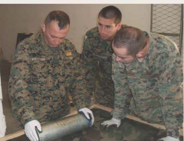
AF BiH soldiers beeing trained on amunition handling

Over the course of the training, AFBiH personnel are given the knowledge to safely handle ammunition, visually checking it for signs of damage and aging. They are given the ability to identify ammunition