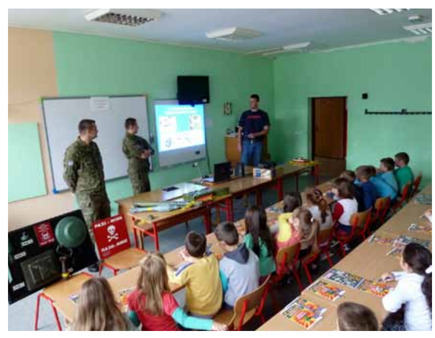
A civillian MRE instructor alongside members of LOT House Foca delivers the training to schoolchildren

On the 29th of September Slovakian personnel of a LOT (Liason and Observation Team) in Foča visited 'Sveti Sava' primary