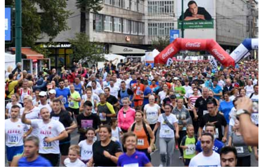
Crowds begin the Sarajevo half marthon