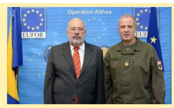
COM EUFOR with the Brazillian Ambassador