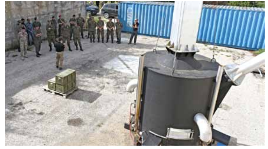
A small arms ammunition furnace at Glamoc

the ammunition was carried out by an Armed Forces of Bosnia and Herzegovina (AFBiH) team together with civilian contractors. This destruction is part of a comprehensive Master Plan of AFBiH to manage their weapon stockpiles, including the destruction of unsafe ammunition