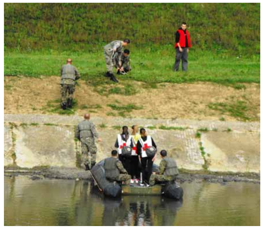
AFBiH soldiers assist a medical team during at a river crossing

As the exercise started, a Crisis Centre was formed in the municipality of Derventa. The Crisis Centre responded to exercise incidents and maintained situational awareness, based on the real environment of the Derventa area. Within the Crisis Centre