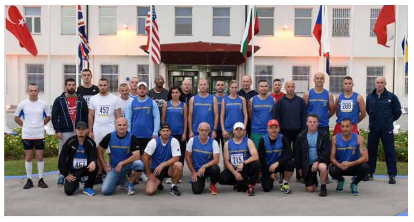
The NATO and EUFOR members prior to taking part in the race

On the 20th of September 28 members of EUFOR and NATO took part in the Sarajevo Half Marathon, running a distance of over 21 kilometers. The event has been run since 2007, and this year a record 1,500 participants from 32 countries took part in different