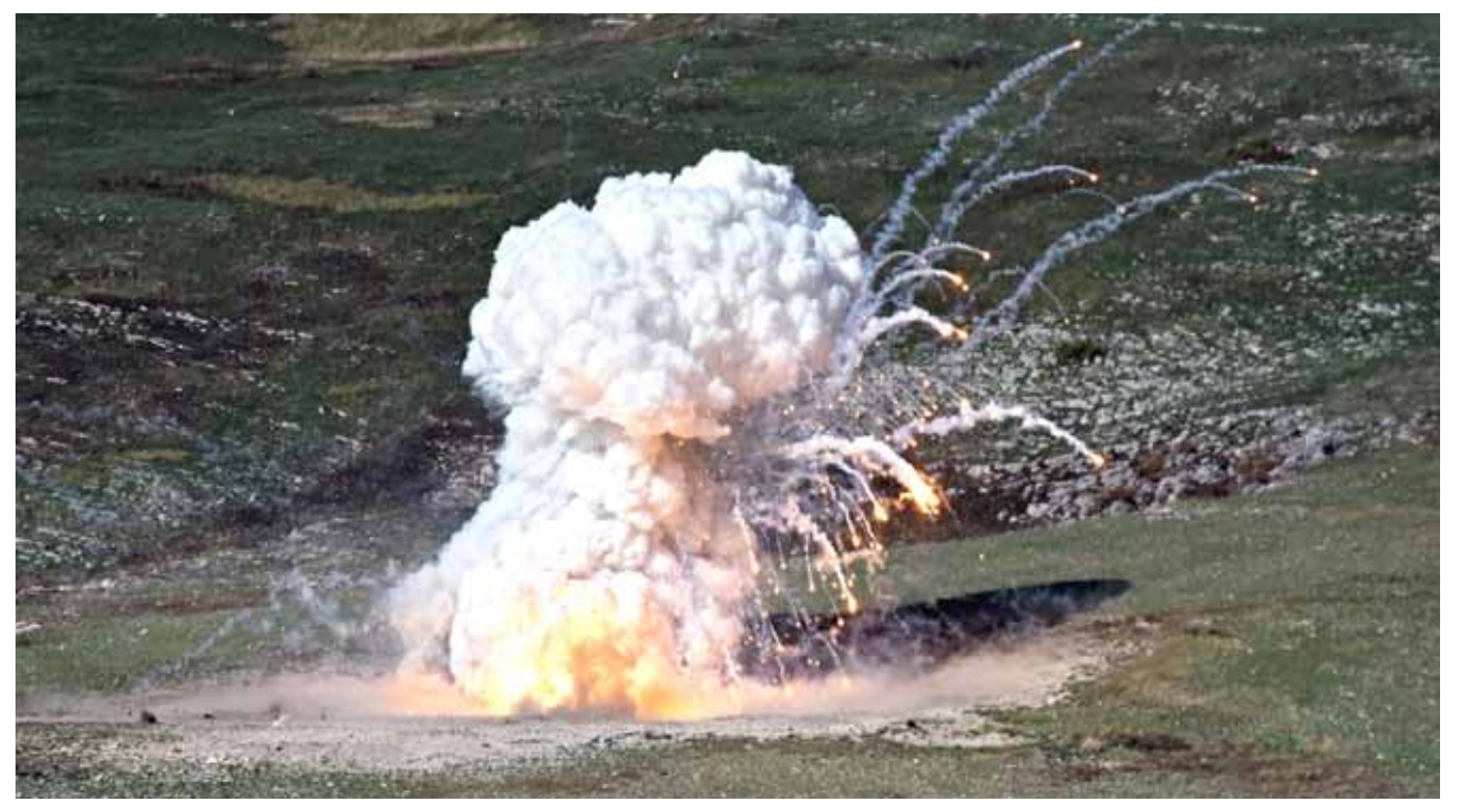
Aircraft bombs being destroyed on the Glamoc range

On Wednesday the 16th of September COM EUFOR Major General Johann Luif visited an ammunition disposal site in Glamoc. During this visit he witnessed the destruction of different types of weapon, ranging from aircraft bombs to small arms ammunition. The destruction of