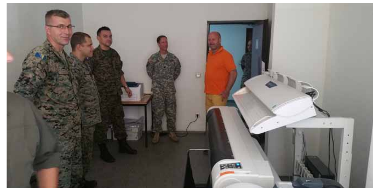
AFBiH course members together with map printing equipment they were trained on

From the 7th of September until the 16th of October 2015, EUFOR conducted five "GEO Courses" for the Armed Forces of Bosnia and Herzegovina (AFBiH) at the Tactical Support Brigade Barracks in Rajlovac. In total 7 personnel from the AF BiH participated successfully.