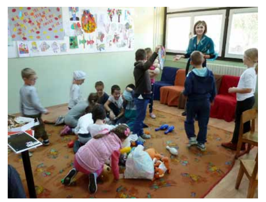
Children of the Sveti Sava school enjoying the new toys