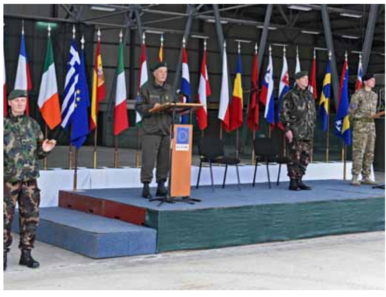
COM EUFOR addresses the parade

the personnel attending for their efforts during the exercise. The ceremony featured all the soldiers who took part in Exercise Quick Response 15. including personnel from Slovakia, Turkey, the United Kingdom and Key Leaders from Romania and Bulgaria.