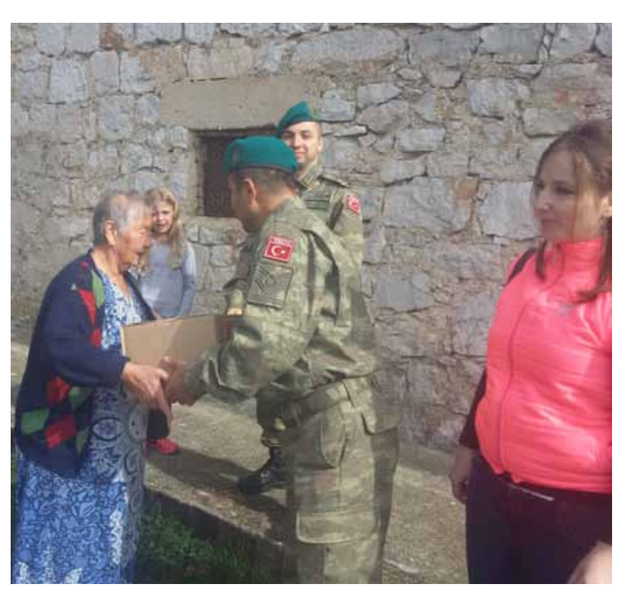
A Turkish LOT House member hands over a food package to a local woman

On the 25th of September members of the EUFOR Turkish Liason and Observation (LOT) Team based in Livno distributed food parcels to needy individuals within their area. The team gave this food as a gesture of good will to the community, strengthening the relationships between the LOT team and the people they live with. By Major liker Emirze