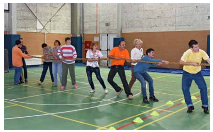
In the gymnasium, the visitors took part in games inlcuding tug of war and a football match