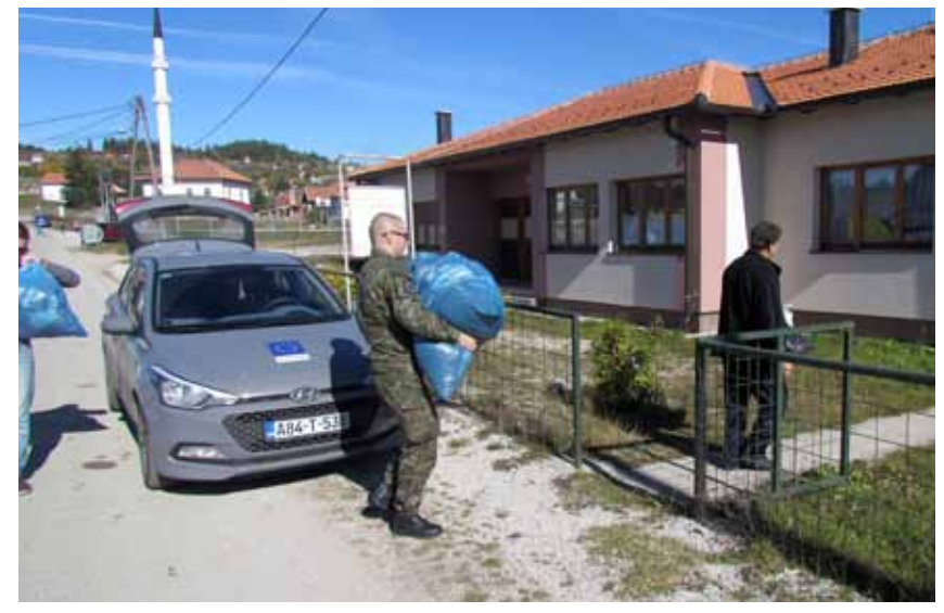
The clothes being taken into the local community centre