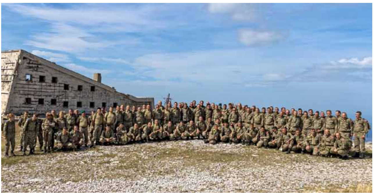
Turkish MNBN soldiers reach the top of Bjelašnica

During September and October the Multinational Battalion conducted two 'Alpine Marches', walking in the area around Bjelašnica.