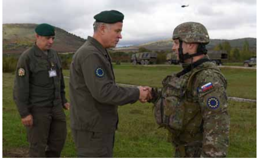
COM EUFOR togather with a Slovakian soldier

I was also pleased that we had the opporttunity for some socialising amoung the different nations on the Sunday of the exercise, which provided a different environment to get to know each other'