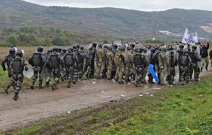
UK and Slovakian soldiers conduct Crowd Riot Control

The training was built around a fictional scenario which required the international force to conduct peace support operations in the host nation.