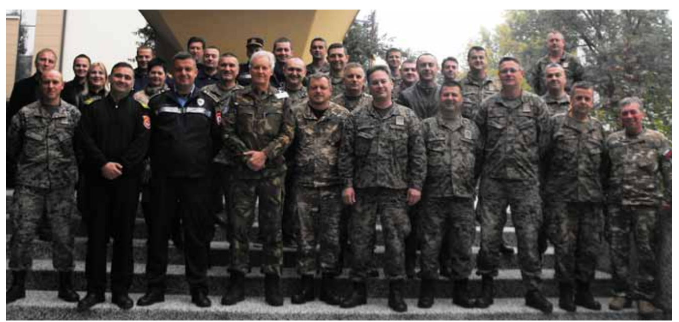
Members of the EUFOR Mobile Monitoring Team alongside AFBiH and civil authorities