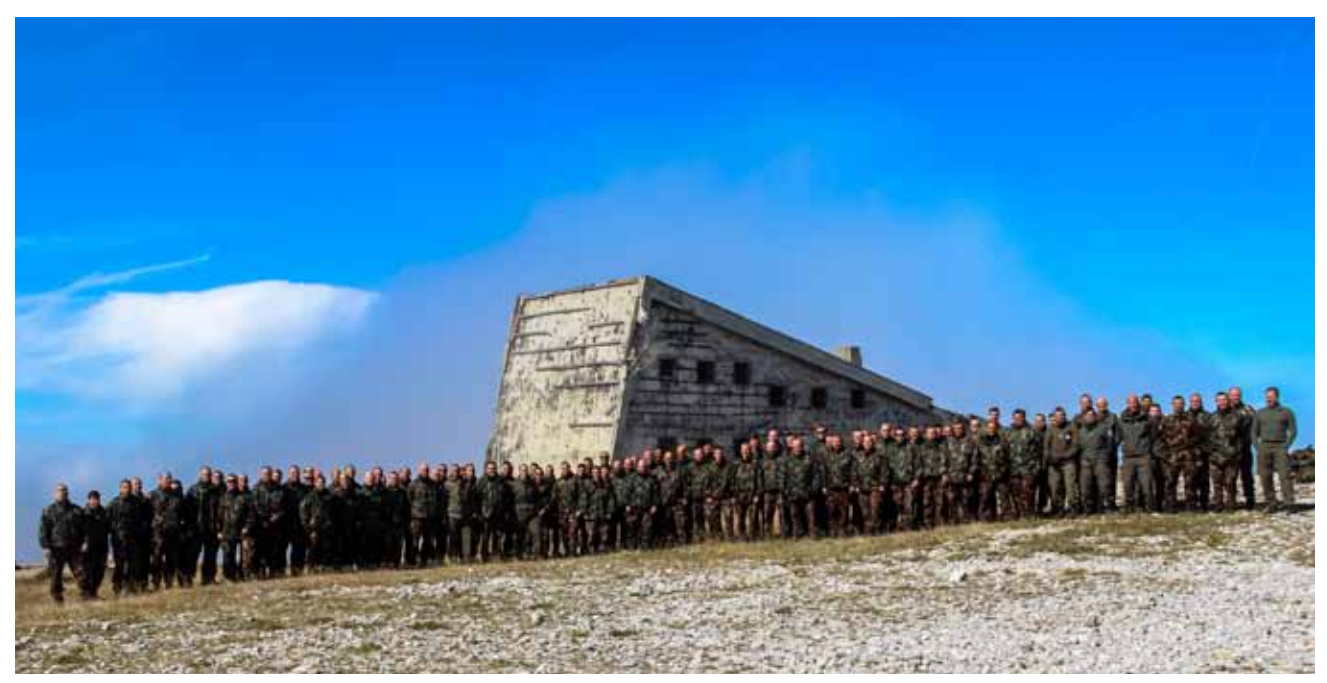
Hungarian MNBN soldiers at the top of Bjelašnica

The Hungarian MNBN Company conducted their walk on the 1st of October. Beggining in cold, foggy conditions they were soon rewarded with clear