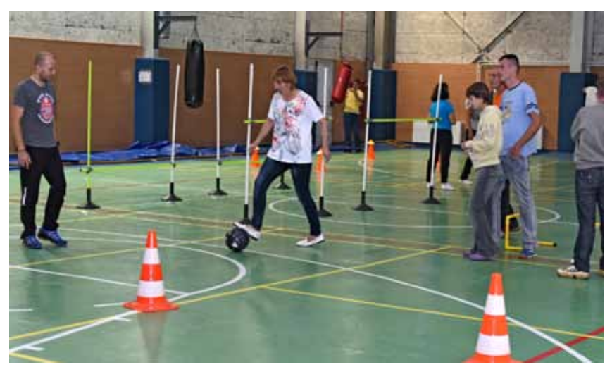
Young people from the institute compete against each other

On the 22nd of September, a group of 16 children and 8 teachers from the Institution for the Protection of Children and Youth in Pazarić visited EUFOR in Camp Butmir. The organisation provides care for disabled children and young people in their area. During the visit the attendees visited the EUFOR helicopter unit and were given live demonstrations of the equipment, witnessing an evacuation drill. During the visit they also had lunch in the DFAC and offered some artworks for sale that the young people had made.