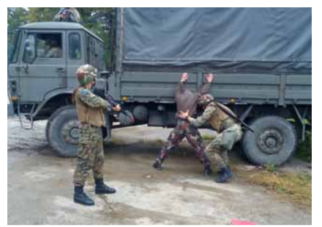
AFBiH soldiers carrying out checkpoint drills