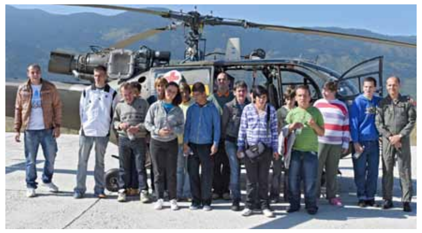
The disabled visitors visiting the EUFOR's Alouette helicopter