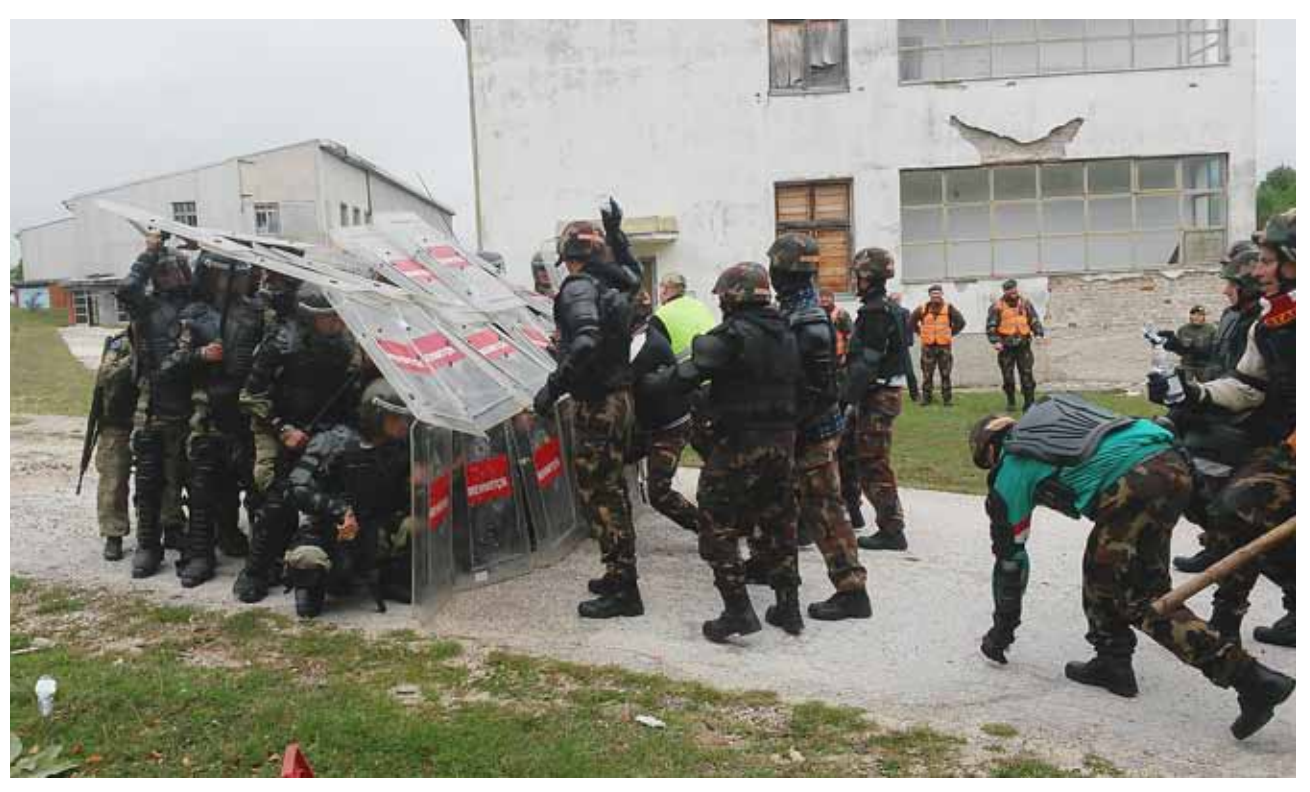
Hungarian soldiers imitate rioting civillians as they attack the Turkish Crowd and Riot control troops

On the 7th of September Turkish and Hungarian soldiers of the Multinational Battalion conducted training in the former military barracks of Kalinovik. The training was based around a fictitious scenario in which the Kalinovik barracks was