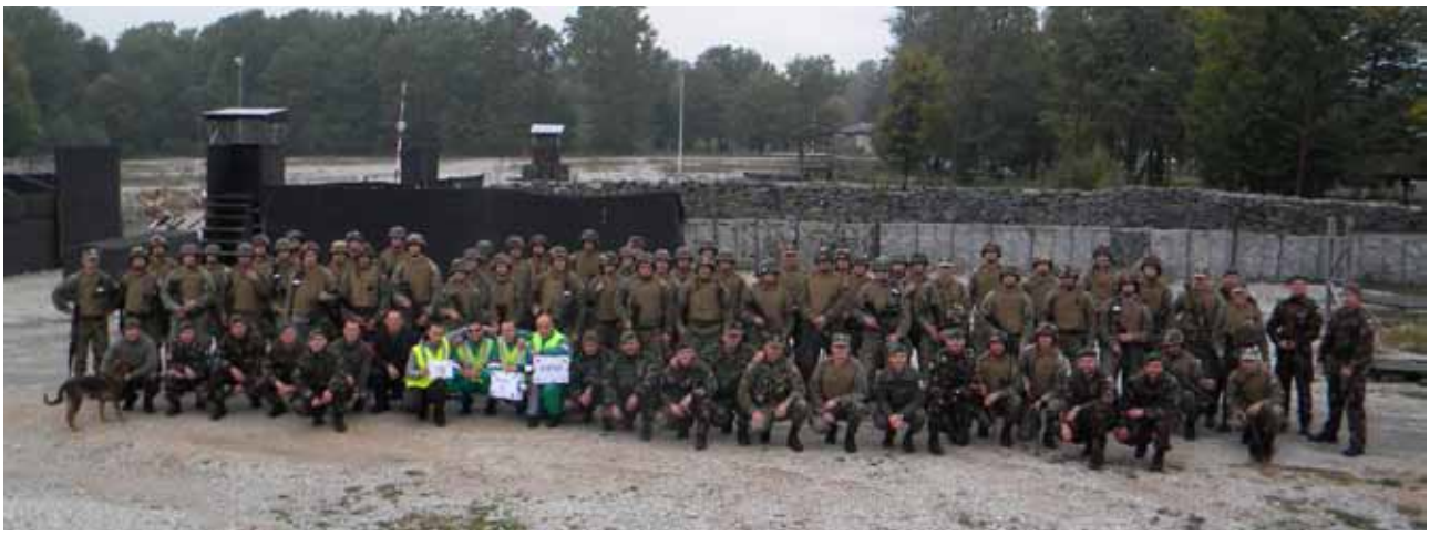
Members of the EUFOR MNBN alongside their AFBiH counterparts

From the 5th until the 9th of October, the Multinational Battalion (MNBN) of EUFOR and infantry from the Armed Forces of Bosnia and Herzegovina (AFBiH) conducted combined training in Dubrave. Lead by the Capacity Building and Training branch of EUFOR, the joint training was set up to instruct soldiers tactically in peace support operation techniques.