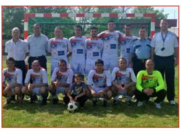
The RS Police Team take first place in the Kozara inter-service football competition.