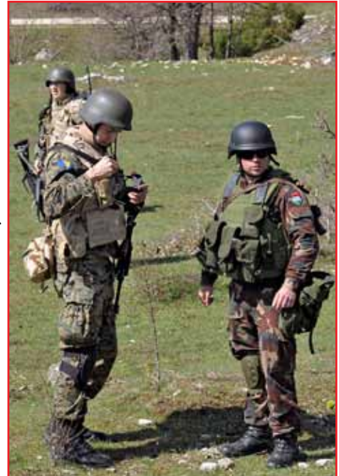
of a safe and secure environment in BiH.

Following this military demonstration the Operational Commander congratulated the participating troops for a superb demonstration of capability and team work. General Shirreff stated that the operation rehearsal and military display from multi-national troops was a clear demonstration that underlined the European Union's ongoing commitment to the support