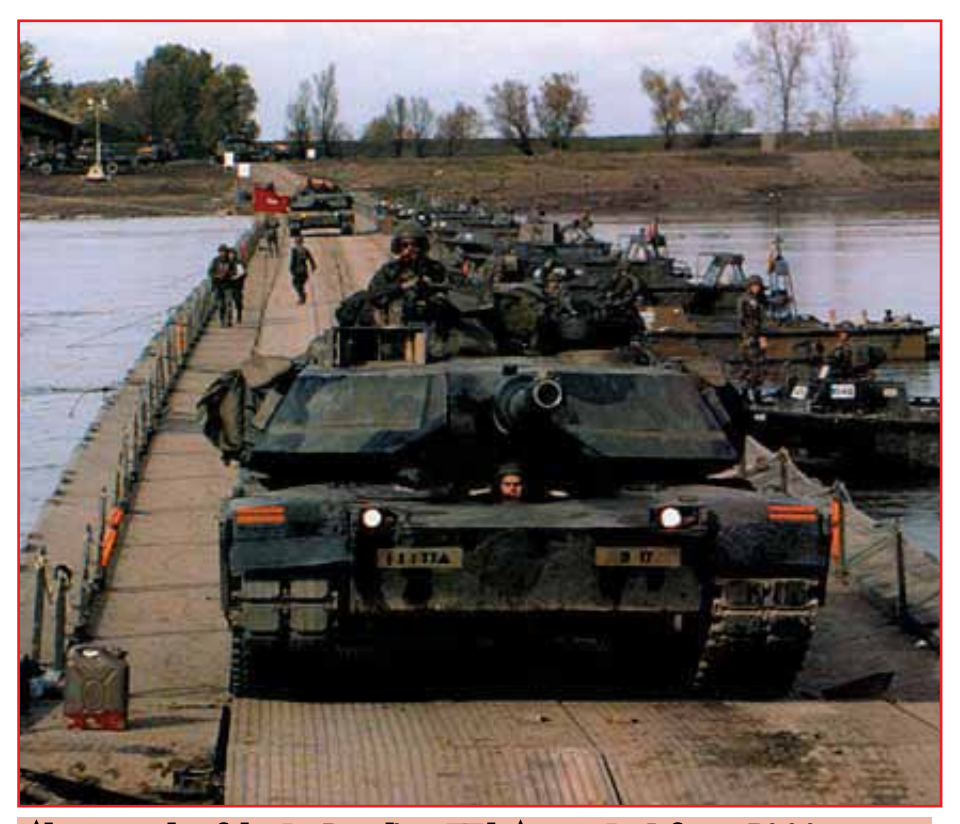
Abrams tanks of the 1st Battalton, 77th Armor, 1st Infantry Division, cross the Sayo River into Bosnia, October 20, 1996. They secured the withdrawal of the 1st Armored Division up to the end of the IFOR mandate on December 20. IFOR, the NATO implementation forces, had enforced the terms of the Dayton Peace Accord since 1995.