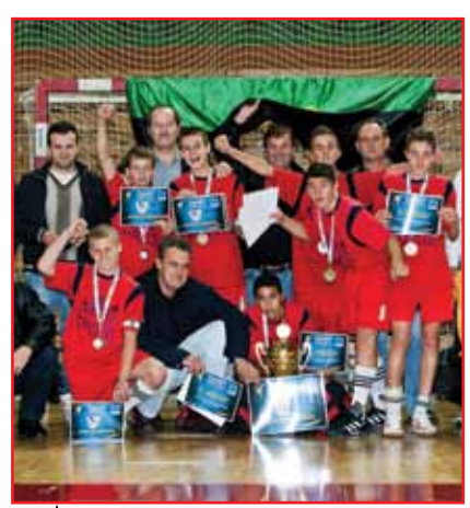
Winning team of EUFOR Cup 2010 comedition

Austrians celebrate their National Day 10&11