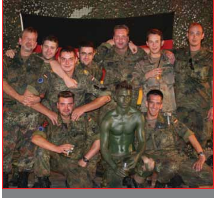
The Incredible Hulk and his friends.

During the ceremony, the German contingent introduced itself by performing short plays to show