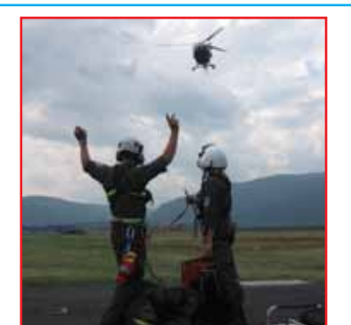
On the front page: Austrian MEDEVAC is ready to hook the wintch to the helicopter.