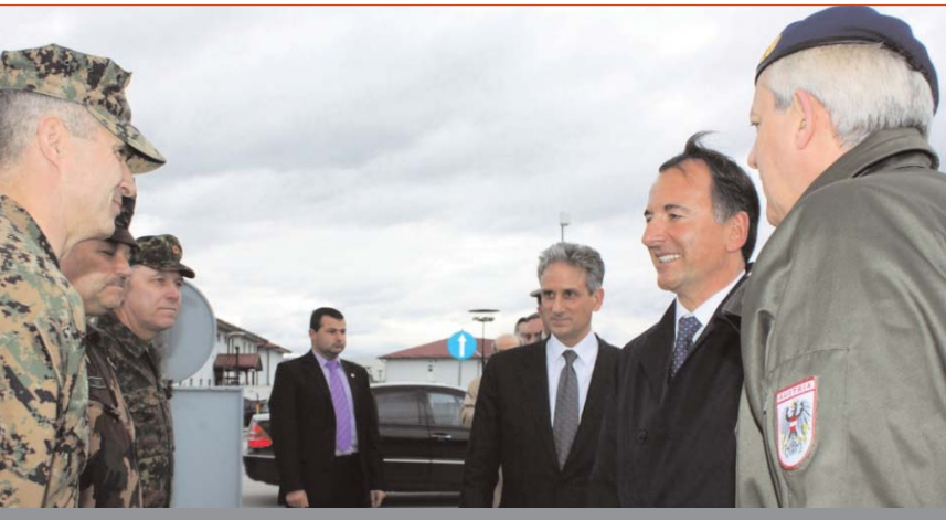
COM EUFOR and COM NHQSa with the Italian Minister of Foreign Affairs, Mr. Franco Frattini.