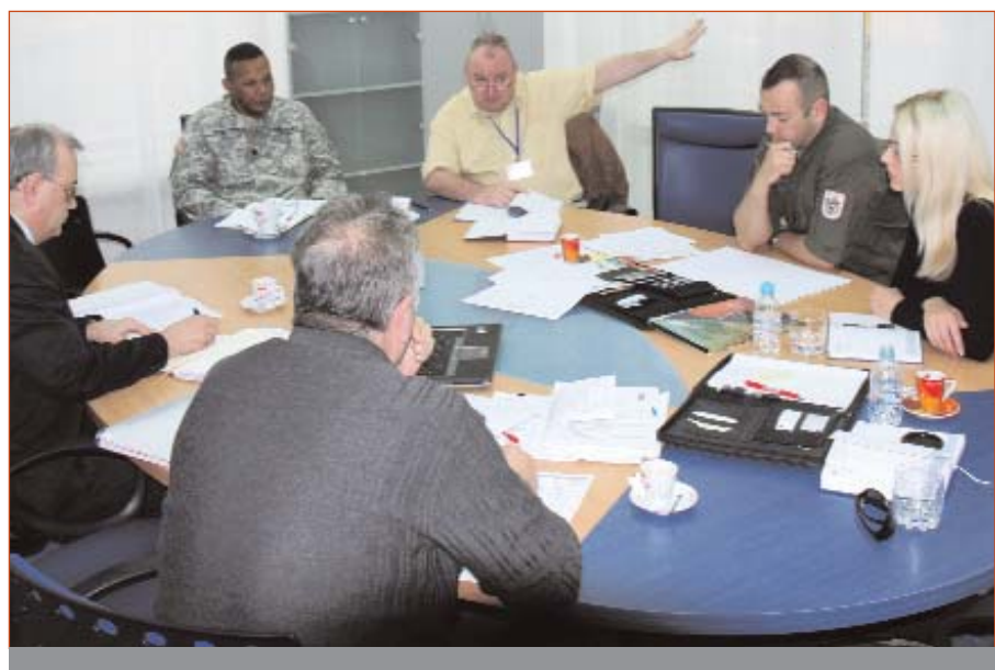
The Joint EUFOR and NATO inspection team audit company records.

On conclusion of the visit, the Joint Inspection Team thanked the management of Unis Pretis for their excellent cooperation