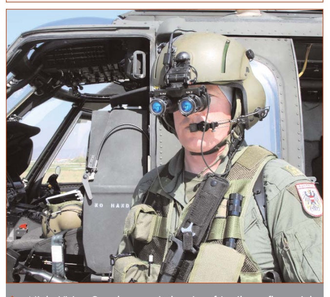
Night Vision Goggles permit the aircraft's pilot to fly at night The S70-A-42 version of the Blackhawk operates with a glass cockpit, (computer screens instead of analogue dials that allow the pilot more time to concentrate on flying the mission safely).