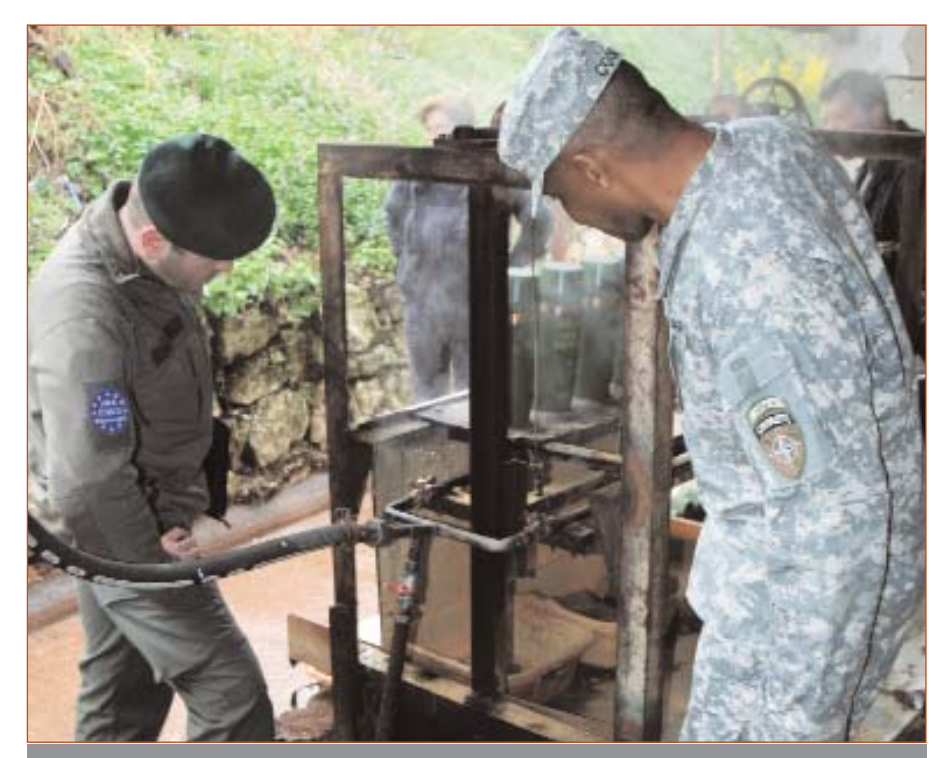
The Joint EUFOR and NATO inspection team observe the destruction of artillery shells at the Unis Pretis facility.

tons per year. The destruction of the surplus ammunition is a pre requisite for NATO membership therefore this represents a significant contribution towards this goal. During the review of procedures between the Pretismanagement and DIF Inspection Team various options were scoped to further improve