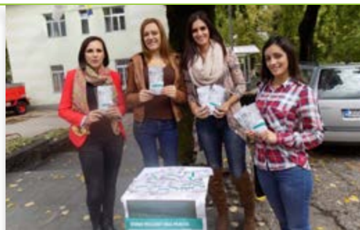
Young people contributing to the common good - volunteers on the "Improvement of Patients' Rights" project