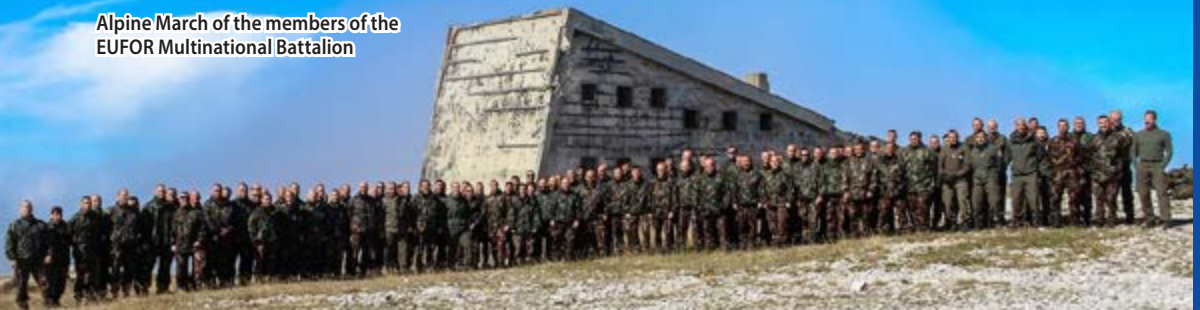
Alpine March of the members of the EUFOR Multinational Battalion