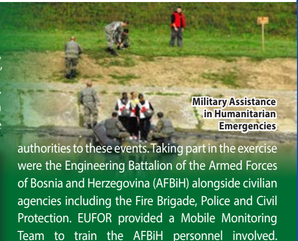
Military Assistance in Humanitarian Emergencies

authorities to these events. Taking part in the exercise were the Engineering Battalion of the Armed Forces of Bosnia and Herzegovina (AFBiH) alongside civilian agencies including the Fire Brigade, Police and Civil Protection. EUFOR provided a Mobile Monitoring Team to train the AFBiH personnel involved.