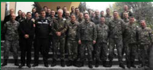
Participants of the Exercise

From the 28th of September until the 9th of October, a 'Military Assistance in Humanitarian Emergencies' exercise was conducted in the area around Derventa. The scenario for the exercise involved heavy rain and earthquakes, focusing on the response of the