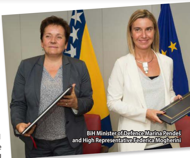
BiH Minister of Defence Marina Pendeš and High Representative Federica Mogherini

This new framework instrument will allow, on a case-by-case basis, the smooth involvement of Bosnia and Herzegovina in on-going and future EU crisis management efforts across the world. It will avoid unnecessary delays where Bosnia and Herzegovina is invited and agrees to participate in EU operations and will offer enhanced effectiveness and flexibility in response to future crises. It also further confirms BiH's increasing role and commitment as security provider notably as regards its current contribution to UN Peace Keeping Operations.