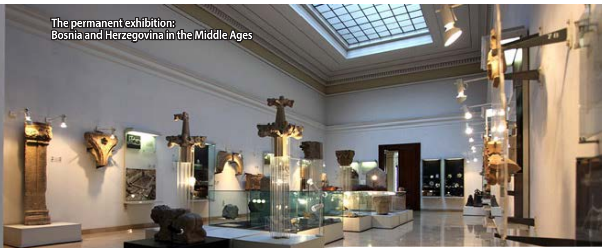
The permanent exhibition: Bosnia and Herzegovina in the Middle Ages

Within the Department of Archaeology is kept a famous prehistoric boat dating from the 8th century BC. Alongside it are artifacts of prehistoric cultures, two-relief altar screen of the Mithra's sanctuaries, Roman mosaics, architectural fragments of early Christian basilicas, weapons, and jewelry.