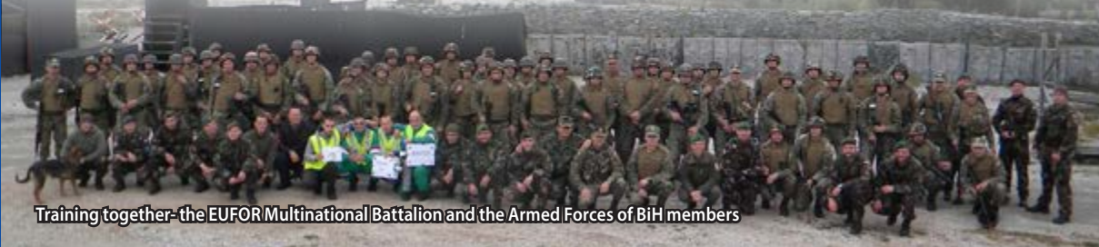
Training together- the EUFOR Multinational Battalion and the Armed Forces of BiH members