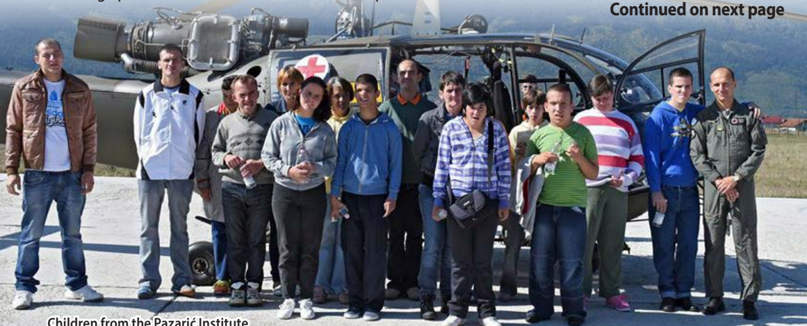
Children from the Pazarić Institute visiting the Austrian helicopter unit