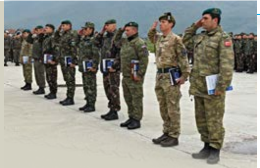
Representatives of the troops which took part in the exercise

On the 22nd of October a closing ceremony was held for Exercise "Quick Response 15". The ceremony was presided over by Commander EUFOR who made a concluding speech thanking the personnel attending for their efforts during the exercise. The ceremony featured all the soldiers who took part in this year exercise, including personnel from Slovakia, Turkey, the United Kingdom and Key Leaders from Romania and Bulgaria.