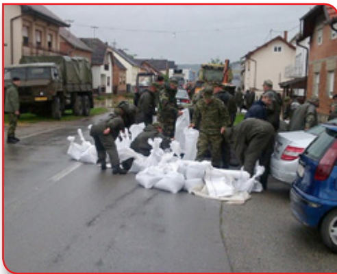
Troops from Croatia

Slovenia provided a rescue unit with four boats and two helicopters including crews and equipment necessary for evacuation.