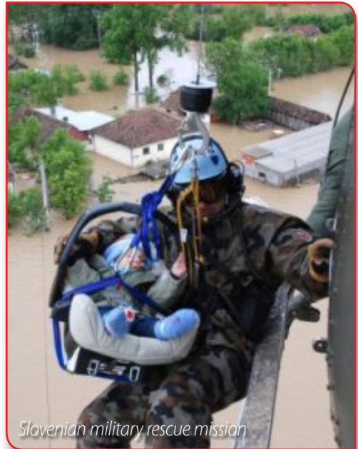
Slovenian military rescue mission

The Croatian Government provided two helicopters of the Croatian Air Force, with 2 crew members and 2 teams for search and rescue. In total, 15 members of the Croatian Armed Forces have been deployed in BiH, made around 200 flights, transported about 500 people, and 90 tons of various materials.