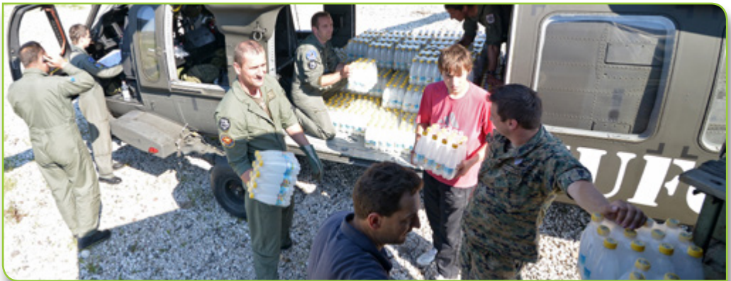
Multinational troops working together in Šamac