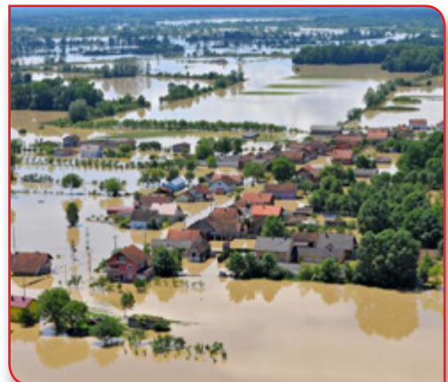
Observed from the air, almost a third of Bosnia chiefly in the northeast resembles a huge muddy lake, with houses, roads, and rail lines submerged.

EUFOR representatives were continuously monitored the situation after receiving initial