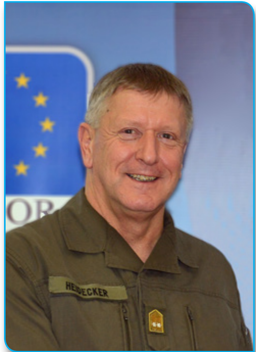
Major General Dieter Heidecker

Being a visible part of the European Union's comprehensive approach in Bosnia and Herzegovina, EUFOR lent its support to the rescue and disaster relief efforts of the local authorities. Initial activity consisted in transporting approximately 140 tons of relief supplies to the population and the Armed Forces BiH, moving rescue teams into position and evacuating approximately 900 people to safety in a very short time, including medical evacuation. During the exercise "Joint Effort" – conducted with the Armed Forces BiH and three EUFOR reserve companies from UK, Slovenia and Austria – our main effort was on removing debris and waste from homes and businesses, disinfection as well as on transporting aid and reconstructing roads.