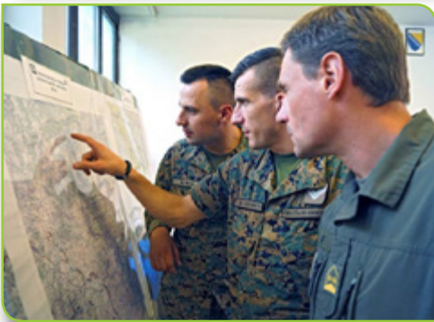
The exchange of information is very important