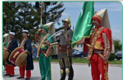
The oldest military marching band in the world

of the Fall of Constantinople to the forces of Sultan Mehmed II—the tradition had been fully restored as a band of the Turkish Armed Forces.