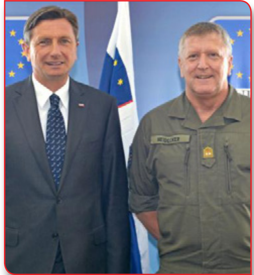
The President of Slovenia, Mr Borut Pahor, visited EUFOR Althea

The incoming Slovenian troops in EUFOR consisted of an Infantry Platoon, a specialist Veterinary Unit and a Decontamination Unit, which were used to disinfect areas to prevent the spread of disease after the flooding events.