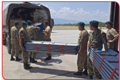
EUFOR's Turkish Company transported humanitarian aid from Tuzla airport to Maglaj, Žepče, and Doboj. The aid goods mostly consisted of generators, medical equipment, blankets, food and sleeping bags.