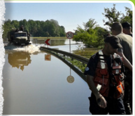
Where roads have been passable, trucks from the EUFOR Multinational Battalion have been used to transport a number of supplies including boats and engineering equipment.