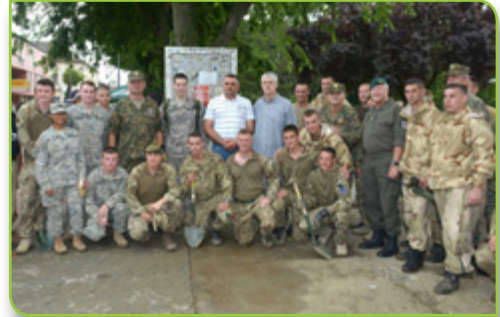
EUFOR Commander together with Multinational troops working in Šamac