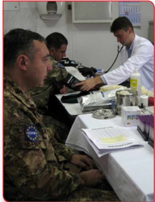
One injured adult person may need 40 units of blood in case of emergency