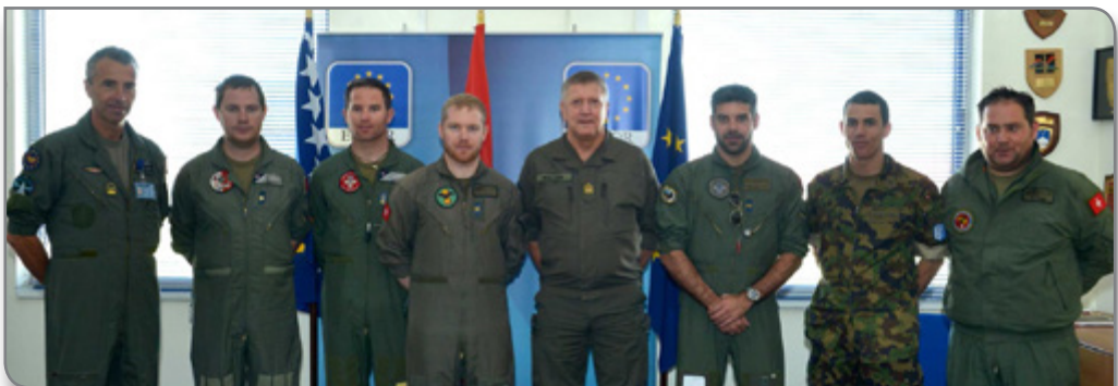
The Swiss KFOR helicopter crew working in EUFOR returned to Kosovo