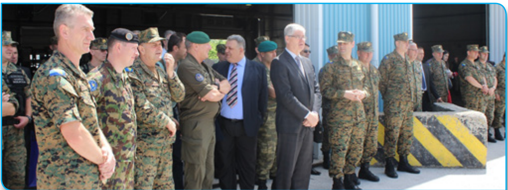
The ceremony was also attended by representatives of EUFOR HQ led by the Commander, Major General Dieter Heidecker

areas. "This donation significantly improves the operational and technical capabilities of the AFBiH. These 79 forklifts came as a result of the continuous work of the Strategic Committee for Weapons, Ammunition, Mines and Explosives", Minister Osmić stated. The donation is a concrete contribution of Switzerland to AFBiH capacity building in the process of disposal of the enormous quantities of dangerous ammunition in BiH.