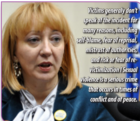
Jasminka Džumhur - Ombudsman for human rights of BiH

From 4-6 June 2014, Peace Support Operations Training Center (PSOTC) hosted a Prevention of Sexual Violence Training Module - Train the Trainer Workshop. Through this Workshop, the United Kingdom Foreign Commonwealth Office (FCO) and the Ministry of Defence of Bosnia and Herzegovina (MoD) showed that they are dedicated to the utilization of PSOTC expertise as a platform to develop and deliver a Prevention Sexual Violence (PSV) training module within selected PSOTC residential and Mobile Training Team (MTT) courses as well as within the Armed Forces BiH and the armed forces of other countries in the Western Balkans.