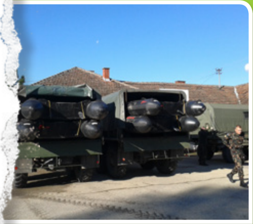
Boats from rafting companies in the Konjic area have been transported by EUFOR trucks to support evacuation of personnel