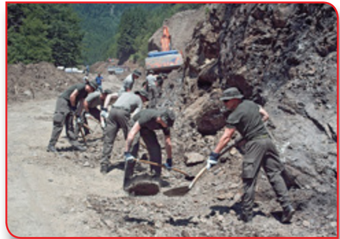
The Austrian Reserve troops deployed for roads reconstruction

"A part of EUFOR's mandate is providing support to BiH authorities to maintain the safe and secure environment in BiH, while the other part is to assist AFBiH capacity building and training. In line with these mandates we are not in the group of organizations that are top listed for response to relief disasters, and we cannot operate on our own, but only upon request from BiH authorities", declared the EUFOR Commander, adding that there is always space for improvement. "Things can be better in terms of equipment and training for missions. We should always draw lessons from situations of this type, and always be prepared for them." The next step is to conduct a thorough analysis of lessons learned, so that we can all learn