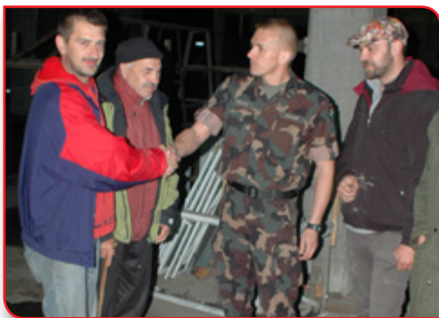
Hungarian contingent assists in flooded areas