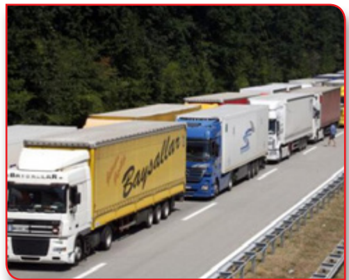
20 tons of food for BiH and Serbia from the Former Yugoslav Republic of Macedonia