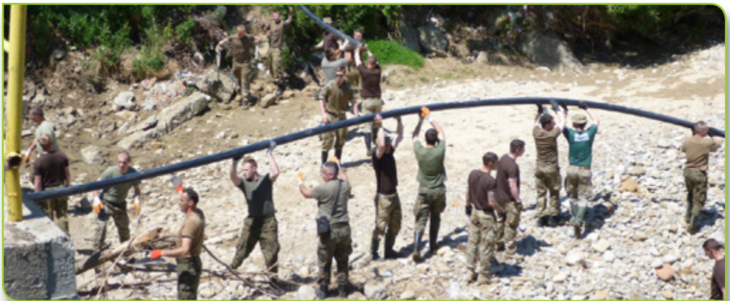
UK and EUFOR soldiers laying pipes in Lopare