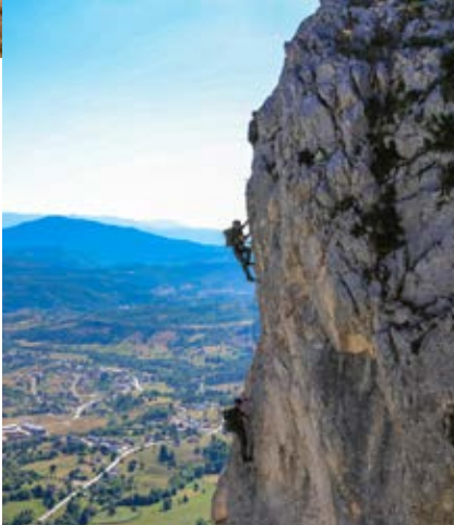
ferata "Sokolov Put" and two rope bridges.

From the parking lot, the high plateau was reached through the Via