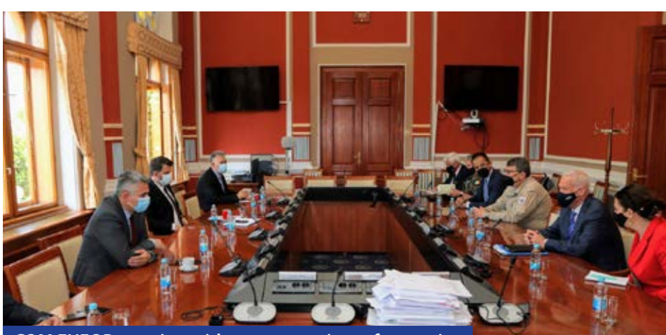
COM EUFOR meeting with representatives of executive and legislative powers of Brčko District in the City Hall

district for their update on the security issues and development of the district. Major General Platzer, is proud of the continued cooperation with the Brčko